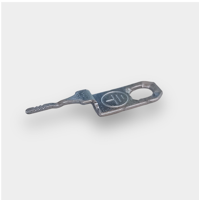
Earth-tag SLK 3